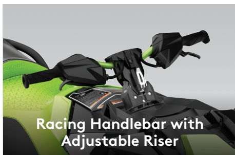
Racing Handlebar with Adjustable Riser

A narrow seat profile with deep knee pockets lets riders sit naturally and use the leg muscles to hold onto the machine for more control.