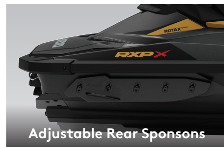
Adjustable Rear Sponsons

Limits bow rise and improves performance in all water conditions.