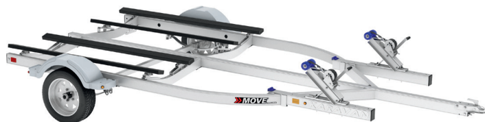
Aluminum MOVE II