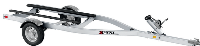
Aluminum MOVE I Extended 1250