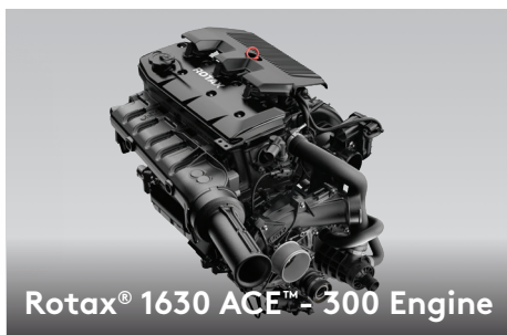
Rotax® 1630 ACE™ - 300 Engine

The Rotax® 1630 ACE - 300 is the most powerful Rotax® engine ever, delivering high efficiency and the best-in-class acceleration.